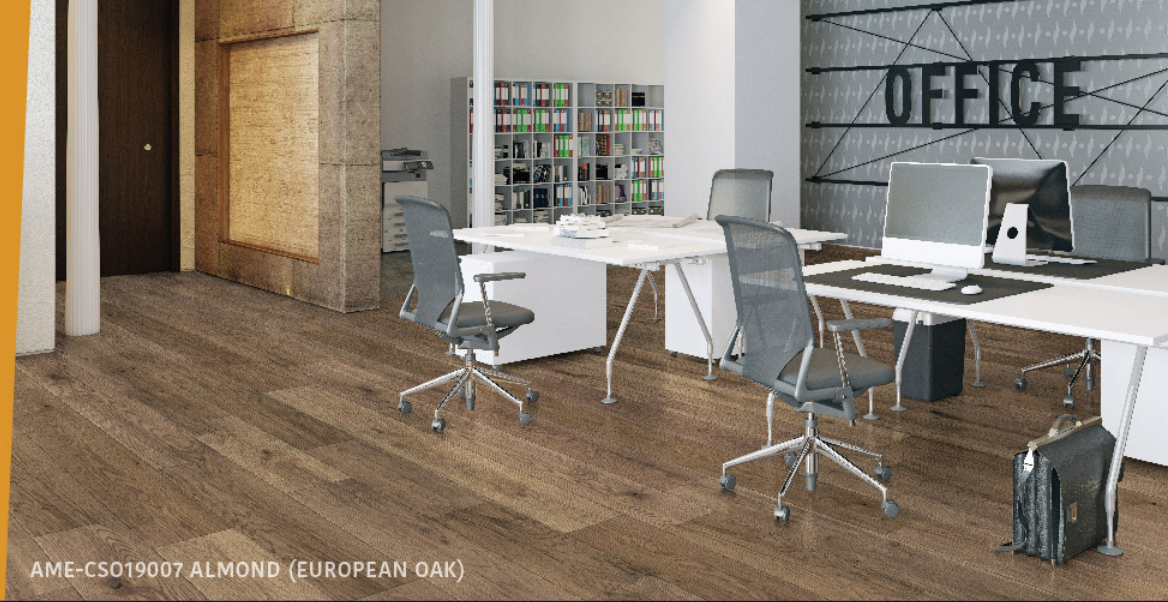
AME-CSO19007 ALMOND (EUROPEAN OAK)