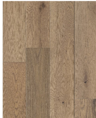
BISCUIT (EUROPEAN OAK) AME-CSO19008