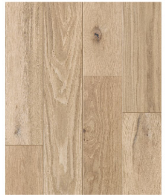
DRIFTWOOD (EUROPEAN OAK) AME-CSO19003