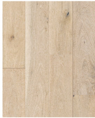
TORTILLA (EUROPEAN OAK) AME-CSO19001