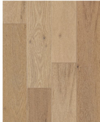
PEBBLE (EUROPEAN OAK) AME-CSO19004