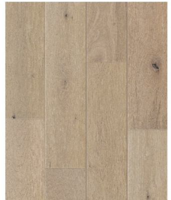
SANDSTONE (EUROPEAN OAK) AME-CSO19009