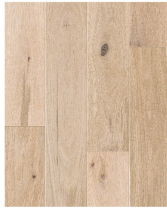
BUTTERMILK (EUROPEAN OAK) AME-CSO19002