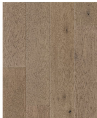
CARAMEL (EUROPEAN OAK) AME-CSO19010