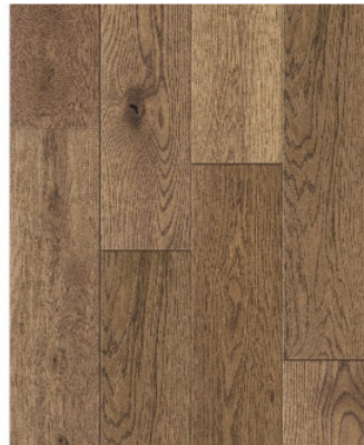
ALMOND (EUROPEAN OAK) AME-CSO19007