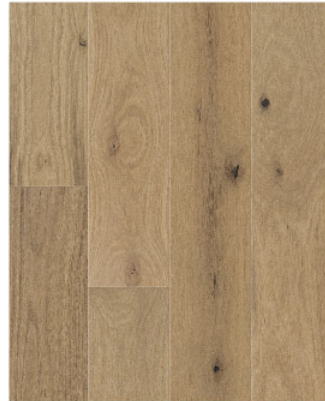
WHEAT (EUROPEAN OAK) AME-CSO19005